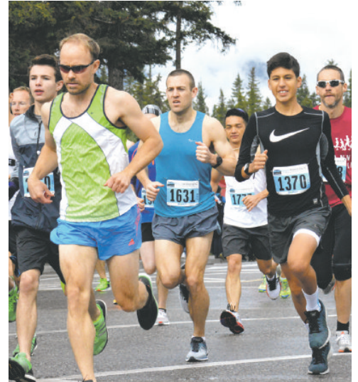
Runners take part in the Banff Marathon, dubbed the World's Greenest Marathon.

In 2019, in which runners from 31 countries participated, it highlighted use of electronic event bags and bio-digestible water cups or "corn cups," the waste diversion from landfills (Towards Zero Waste), being carbon neutral, education and engagement, working with local companies to minimize the environmental footprint and working with suppliers and sponsors to